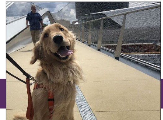
Left: Bread & Butter Market is your closest grocery store, hosts a liquor store and often has food trucks in their parking lot. Right: Make sure you know where to take Fido for preventative and emergency care. Your nearest options are Cook Veterinary Hospital and Uintah Pet Emergency.