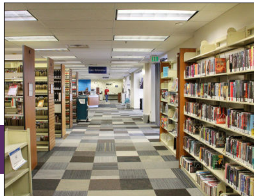
Left: Memorial Hospital is less than two miles from the middle of Downtown. Right: Penrose Library is open Monday through Saturday and has a robust eLibrary.

Nearest convenience store: 7-Elevens on Platte/Wahsatch, S. Nevada/Cimmaron, N. Nevada/Cache La Poudre