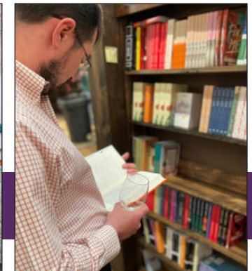
Explore all of this and more, within a mile of your front door. Left to right: Sushi Row, Coralun Vintage, Tattered Cover Bookstore.