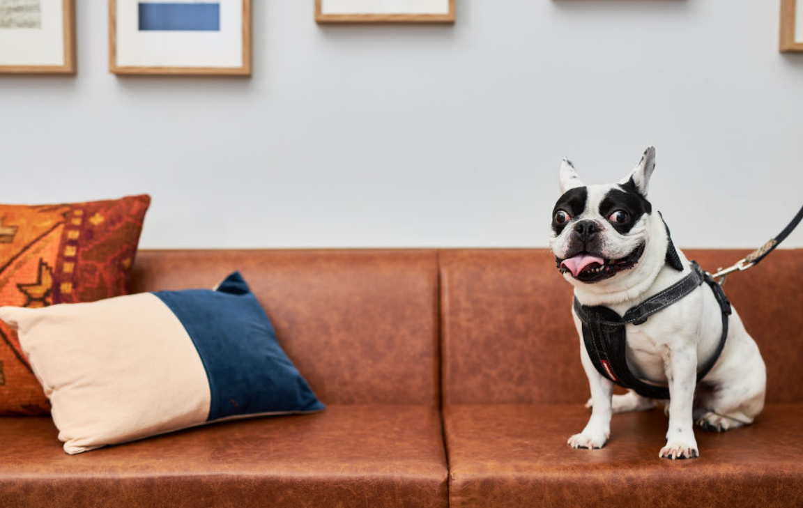
Downtown living is for the dogs! There are lots of pet-friendly apartments as well as restaurant and bar patios.